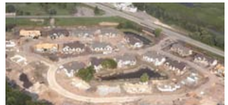
The Summit of Mendota Heights Mendota Heights, Minn.