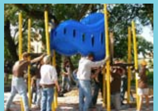
Opus volunteers build playground in Minneapolis