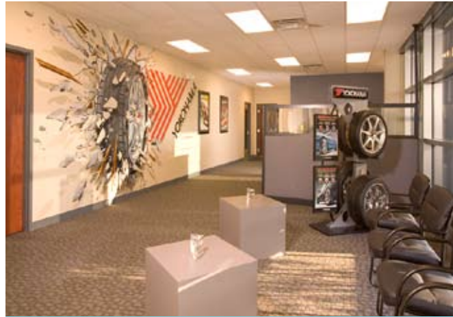
Lobby of Yokohama Facility Rickenbacker V Columbus, Ohio

Operations are near full speed at Rickenbacker V in Columbus, Ohio, the new home of one of Yokohama Tire Corp.'s largest distribution facilities in the world. Yokohama's 653,270-square-foot operation with 76 loading docks is part of Opus North's 3-million-square-foot development near Rickenbacker, a former air force base that still operates a large cargo-only air facility.