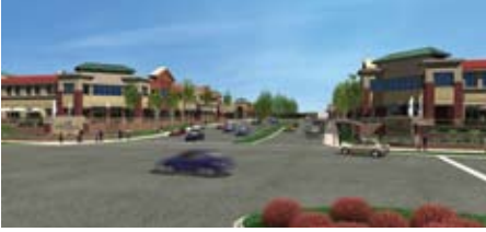
Fountains at Arbor Lakes Maple Grove, Minn.