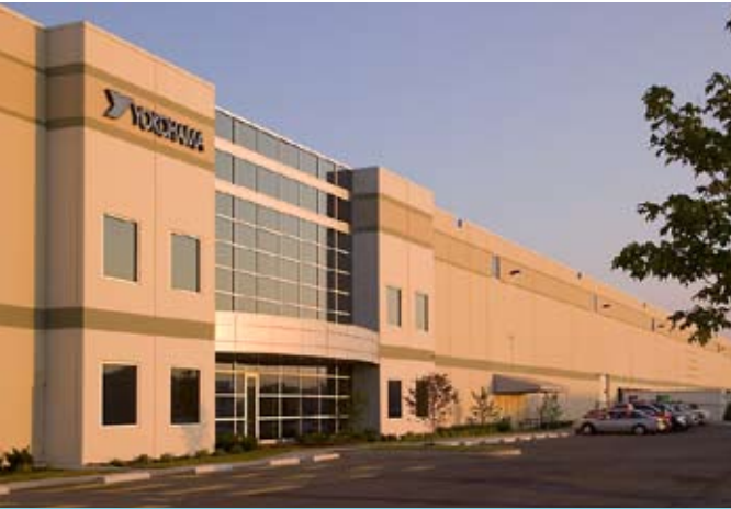
Yokohama Tire Corp. Distribution Facility Rickenbacker V Columbus, Ohio