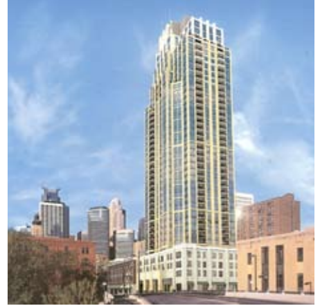
The Carlyle Minneapolis, Minn.