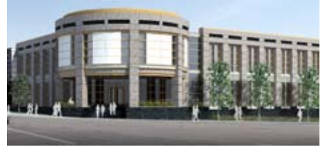
Center for Advanced Imaging Research Rochester, Minn.