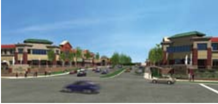
Fountains at Arbor Lakes Maple Grove, Minn.