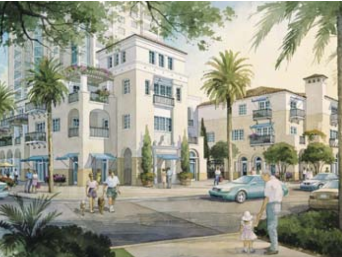
Parkshore Plaza on Beach Drive St. Petersburg, Fla.

Opus Creates Luxurious, Hurricane-Resistant Condos