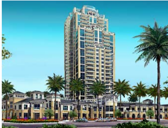
400 Beach Drive St. Petersburg, Fla.

Luxury, quality and safety. Architects and engineers for Opus South Corporation have those three elements top-of-mind when developing downtown St. Petersburg's 117-unit Parkshore Plaza on Beach Drive and the nearby 93-unit 400 Beach Drive.