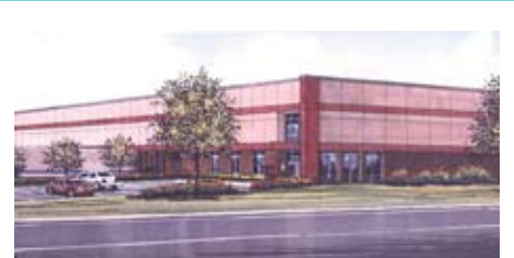
Minnesota Valley Distribution Park Shakopee, Minn.